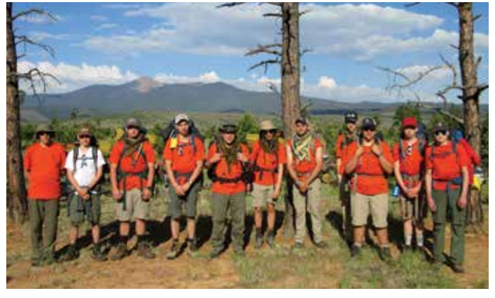
Chester/Deep River Boy Scouts Troop 13 on the trail at Philmont Scout Ranch, Cimarron, NM with Baldy Mountain in the background.

Troop 13 attended June Norcross Webster Scout Reservation in Ashford, CT for Summer Camp on July 18-22. The boys enjoyed swimming, boating, archery, sports, and camping. 13 scouts earned 38 merit badges during the week. Here is a sample of what they earned: Golf, Swimming, Digital Technology, Fish